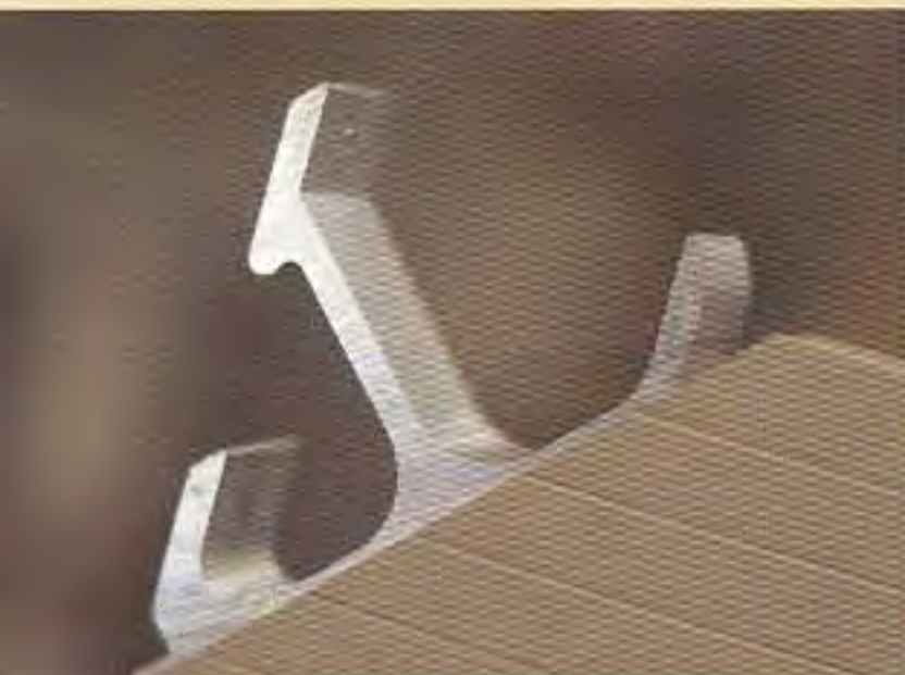
EXTRA HEAVY CORNER GUSSETS