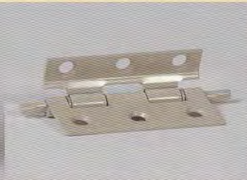
HEAVY DUTY HINGES