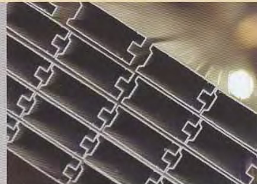
EXTRUDED TUBULAR MAIN FRAMES